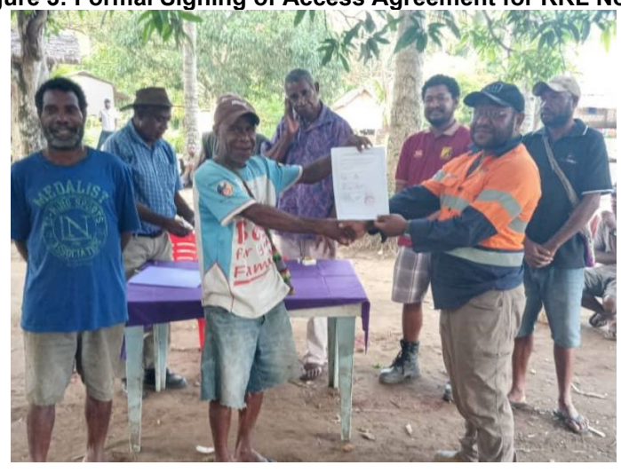
Figure 3: Formal Signing of Access Agreement for KRL North

Field Work: With the Agreement securing access, the Company is now undertaking a comprehensive stream sediment and soil sampling programme covering the eastern, central, and western stream systems forming the major drainage pattern within EL 2558/KRL North. Assessment of outcrops and field observation work is also underway. The intention will be to identify areas for ridge-and-spur and/or gridded soil sampling, potentially leading to a costean sampling programme later in the year.