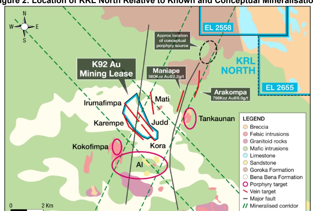
Figure 2: Location of KRL North Relative to Known and Conceptual Mineralisation

As noted above, KRL North borders K92's current tenement package and sits along strike, NNE, on the mineralised corridor representing a portion of the Kainantu Transfer Structure: see Figure 2.